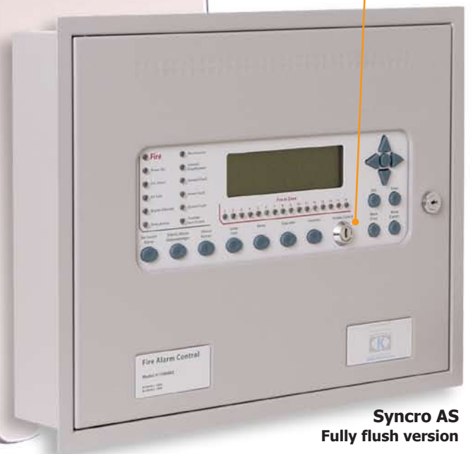
Syncro AS Fully flush version

Options with and without Enable Keyswitch available