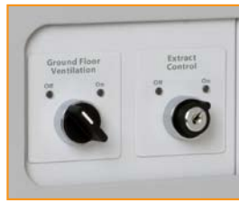
Modular switch plates

Syncro AS is also available in a larger enclosure (M3) that incorporates a second aperture, which allows additional equipment to be added. As well as the thermal printer option, Kentec offers a range of add on's for the Syncro AS that can be used to provide additional rotary switches, key switches, or push buttons. These are available with or without LED indicators.