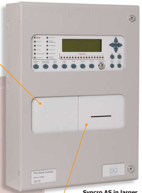
Syncro AS in larger enclosure with printer