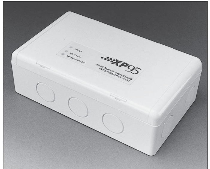
Part no 55000-875

The yellow LED is illuminated whenever a fault condition (open or short circuit) has been detected.